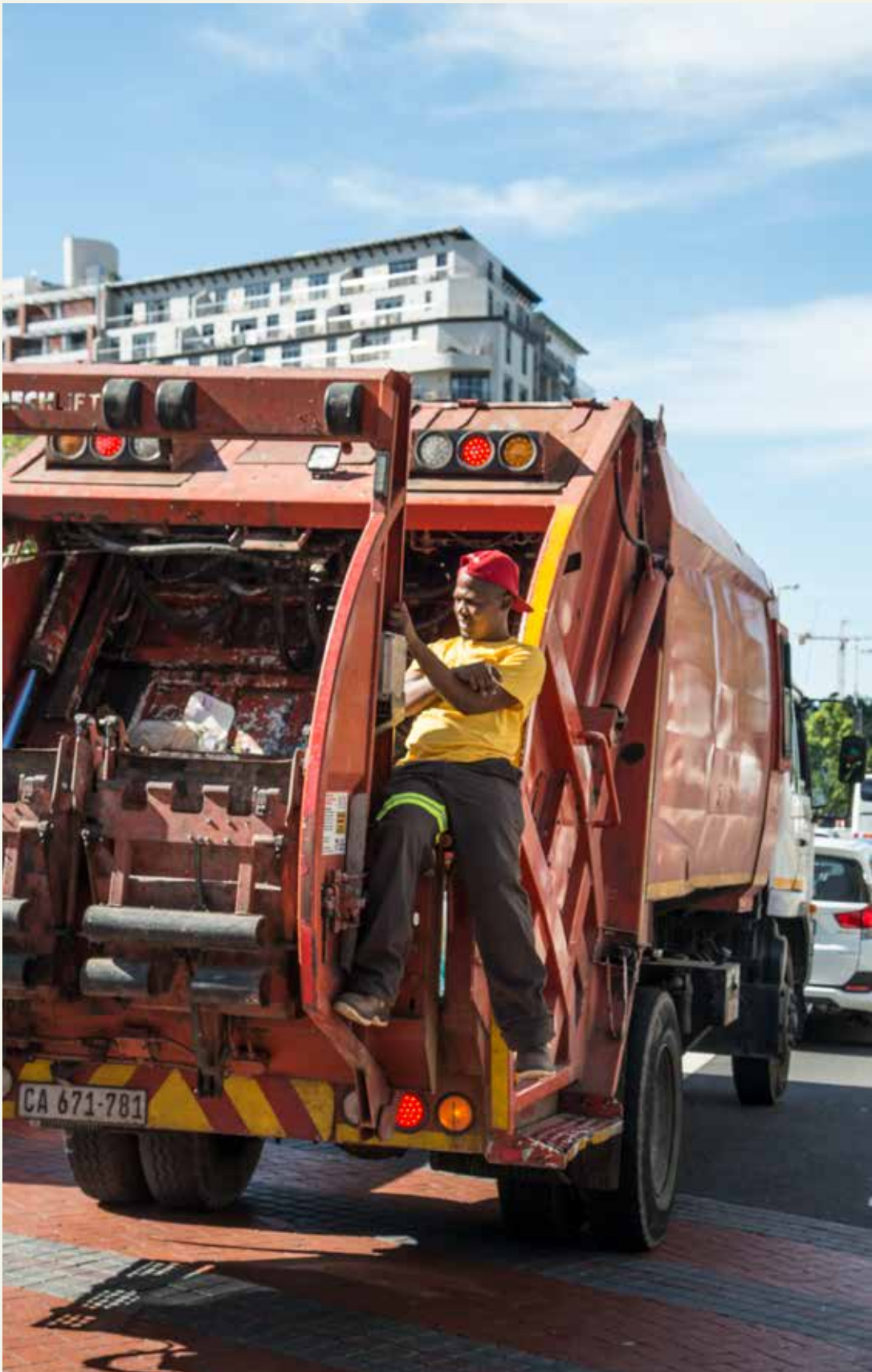
Every day approximately 1 000 tonnes of general waste are collected door to door from households across Cape Town, South Africa.